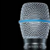
BETA 87A, BETA 87C