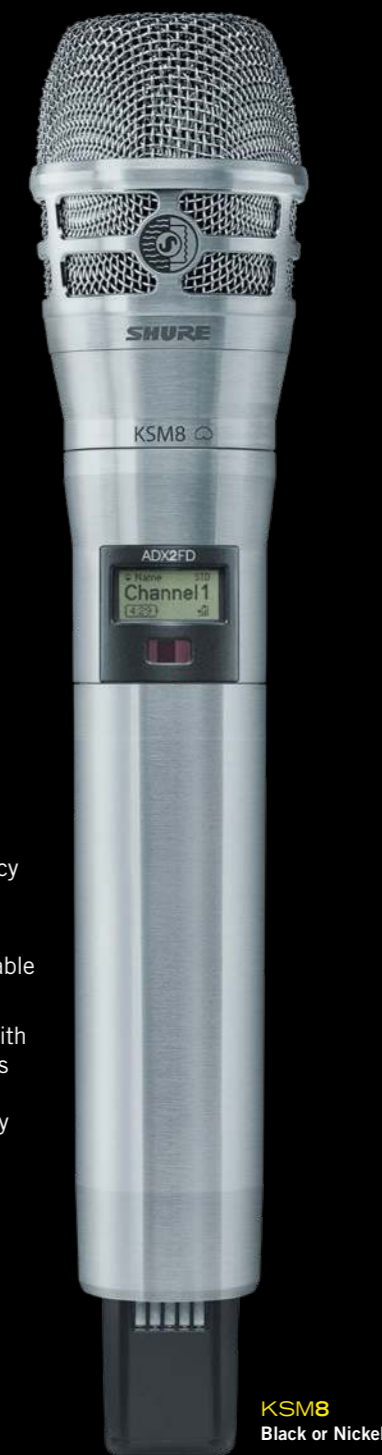
KSM8 Black or Nickel

Also available with these Shure microphone cartridges