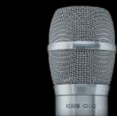
KSM9, KSM9HS (In black or nickel)

Also available with these Shure microphone cartridges