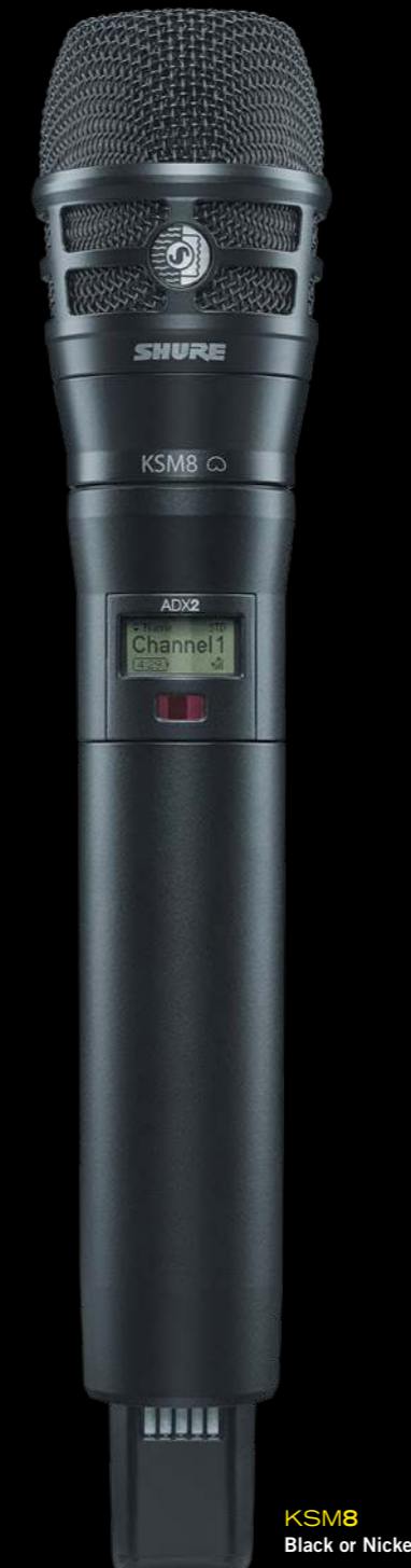
KSM8 Black or Nickel