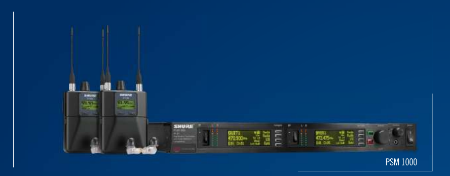
PSM 900 and PSM 1000 Personal Monitor Systems are the first choice for premier events, professional installations and prestige tours. Offering legendary Shure audio quality, pristine RF signal with more channels on air and breakthrough automated features that vastly simplify setup and operation, these systems advance personal monitoring to the highest level.