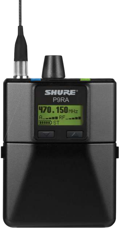
P9RA Wireless Bodypack Receiver